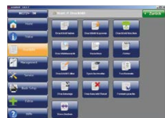
Straight forward operation